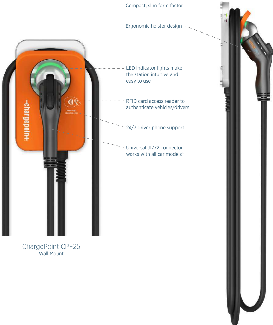
ChargePoint CPF25 Wall Mount