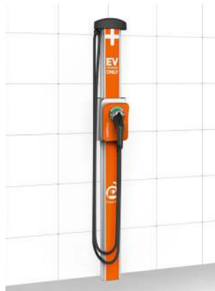
Wall Mount with Cord Management Kit