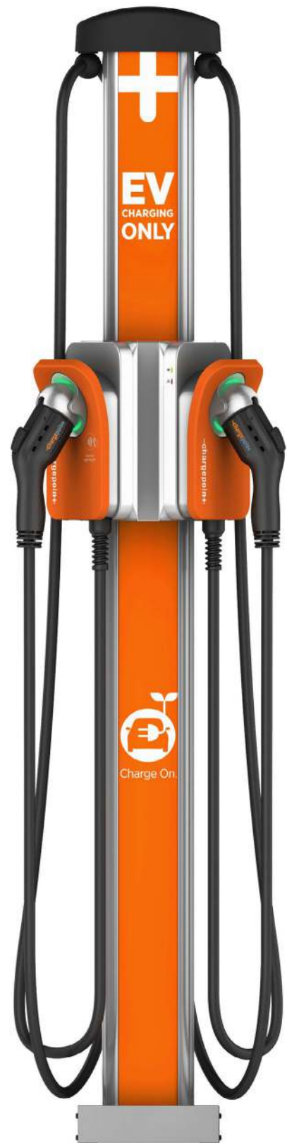
ChargePoint CPF25 Two Stations with Dual Pedestal Mount and Cord Management Kit