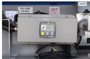
Pulse Meter Option