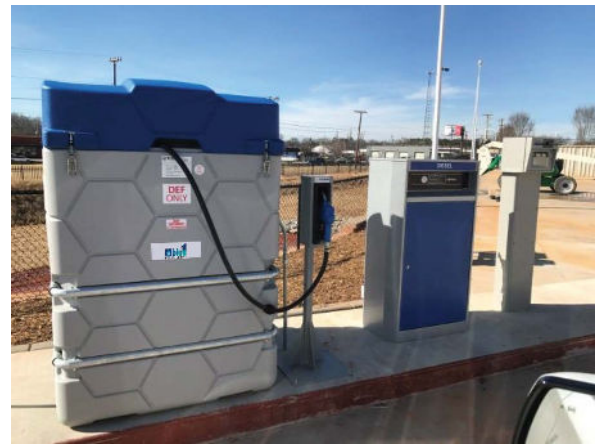
Island Ready Footprint