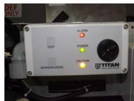
Overfill Bund Alarm