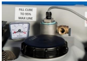
Internal Probe Heater